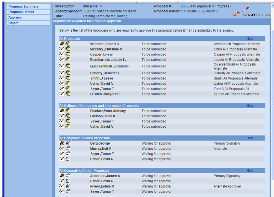
Figure 3. Approval Routing